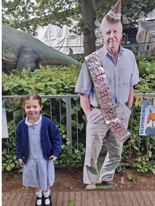
7 - Swingate Meets Sir David Attenborough!

KMTV has been back in school this week, working with our children to create their own “News Nuggets.” Otter Class even visited Rochester Castle to film their very first news report – a fantastic experience! Watch this space for more Swingate press releases.