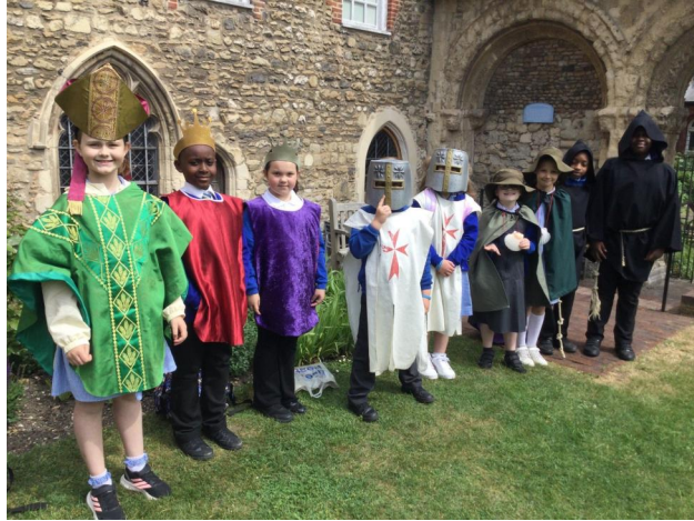
8 - Year 4 enjoyed bringing history to life in Rochester