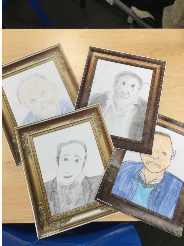
6 - From Pencil to Planet: Honouring Sir David Attenborough!