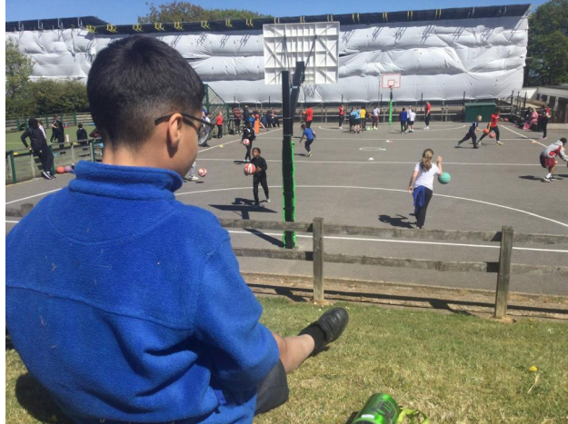
2 - Success at Swingate means thriving academically, emotionally and physically.

Lots of our teachers share the fantastic achievements of our children through their school Twitter pages. The PE team regularly invites children to bring in medals, trophies and certificates from clubs outside of school, and we love celebrating these successes. A huge well done to all our children for everything you achieve beyond the classroom – it's always a pleasure to hear about and celebrate your accomplishments.