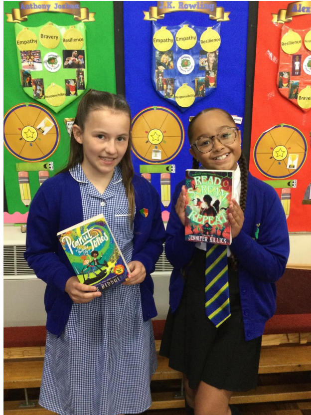
1 - Read, read, read...

Miss Dent launched the Big Book Swap and Random Reading Competition, and it's been wonderful to see the enthusiasm it has created. Our social media has been full of photos of children reading in all sorts of places – to their pets, at the beach, in the park, on rocks, even perched on cars (safely, of course!) and in all kinds of creative positions at home.