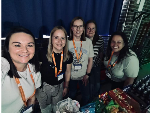
10 - Just some of our SCC tuck shop stars! Forget the supermarkets... we've got better deals, bigger smiles, and top tier treats!

We're already looking forward to next term's adventures, with plans for strawberry picking, visits to the farm, thrilling rides at Chessington, and even a seaside residential packed with opportunity and excitement!