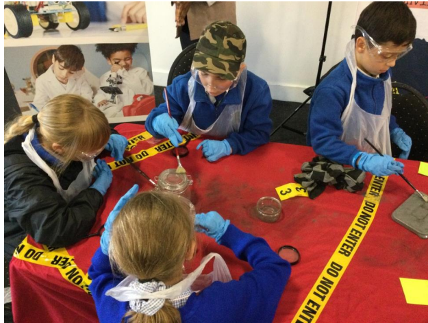
9 - From Classroom to Countryside – Year 3 in Action!

Learning at Swingate certainly doesn't stop at the classroom door. This term, pupils have enjoyed a range of exciting trips to support their learning. Year 3 visited Detling Showground for the Living Land event, while Year 4 travelled to Rochester to bring their learning about the Norman Conquest to life.