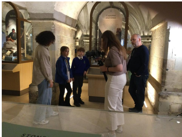
5 - Light, Camera, Swingate! Our News Nuggets in Action!