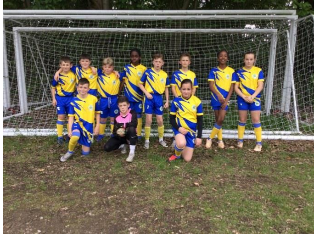
4 - The football team won 9 - 2 against Lordswood in the Medway Football League.