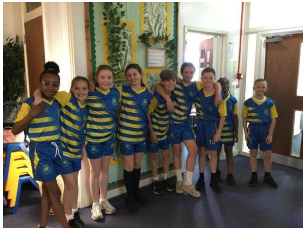
3 - The children came 6th in the Rugby Mini Youth Games. What champions they are!

Lots of our teachers share the fantastic achievements of our children through their school Twitter pages. The PE team regularly invites children to bring in medals, trophies and certificates from clubs outside of school, and we love celebrating these successes. A huge well done to all our children for everything you achieve beyond the classroom – it's always a pleasure to hear about and celebrate your accomplishments.