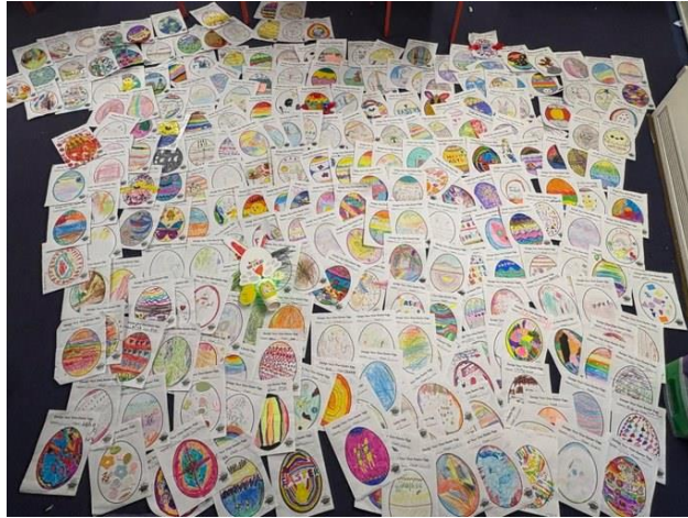
3 - It was an Easter Egg extravaganza!