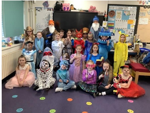
1 - World Book Day 2026

We were absolutely amazed by the generosity shown on Red Nose Day , with a fantastic £403.59 raised! Thank you to everyone who donated. This money will go a long way in supporting children who need it most.