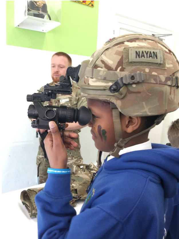
5 - A day at the Royal Engineers Museum