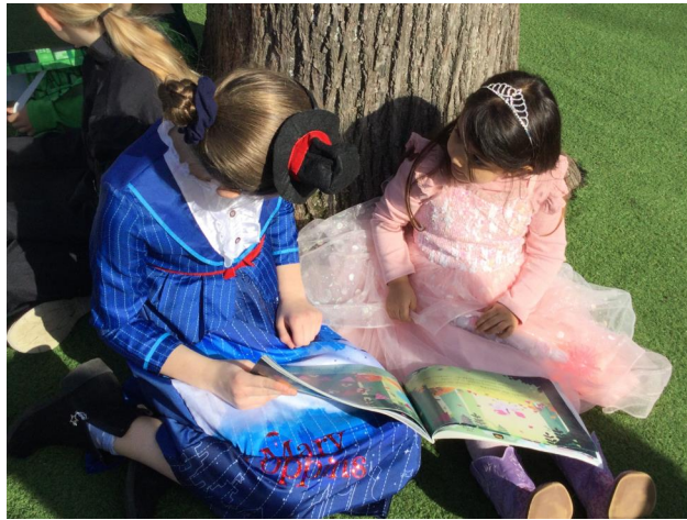
2 - Reading together!