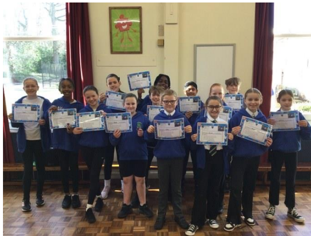
6 - Well done to all of our Sports Crew!